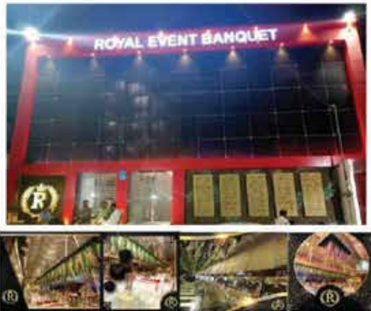
ROYAL EVENT BANQUET