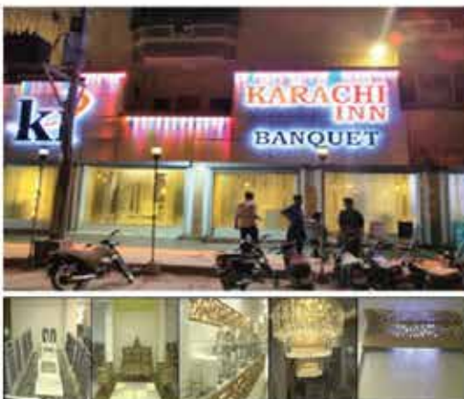
KARACHI INN BANQUET