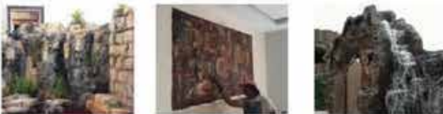
CONCRETE WALL ART AND FOUNTAIN