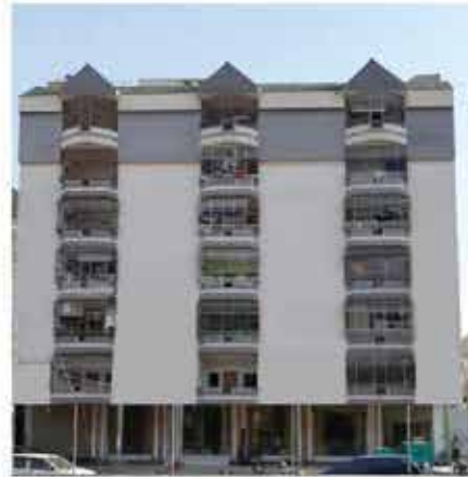
MAHAD RESIDENCY GROUND + 7