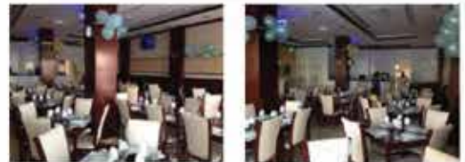
KARACHI INN (RESTUARANT)