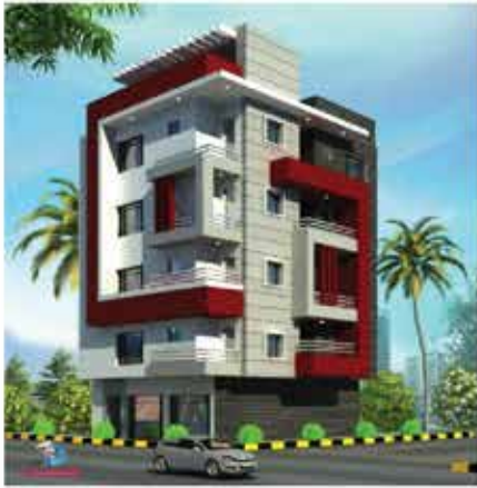
MAHAD EXCELLENCY GROUND + 4