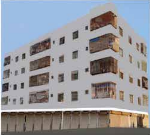
DANIYAL PRIDE GROUND + 4